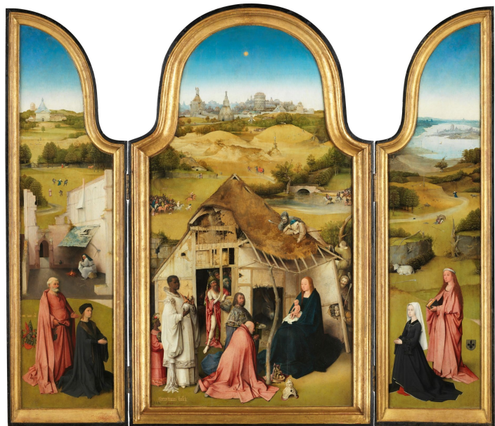
Adoration of the Magi Triptych Hieronymus Bosch (c. 1450–1516) created c. 1494 oil on wood panel | 54" x 57" Museo Nacional del Prado, Madrid

Please join us for refreshments in the Gathering Area following the program.